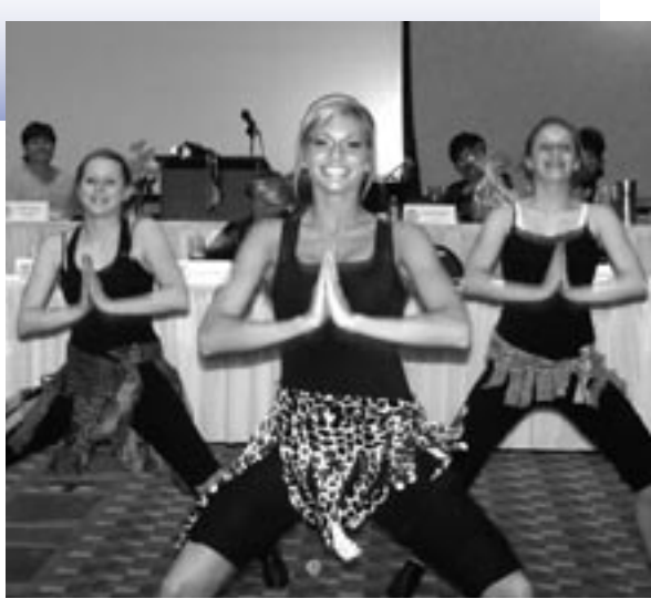
A dance troupe provided the banquet entertainment