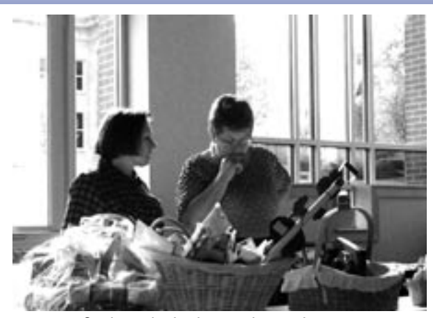
Studying the baskets in the vendor room...