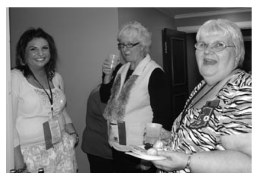
Lots of laughs at the Friday fundraiser!