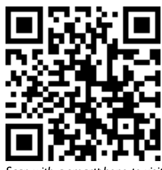
Scan with a smartphone to visit the IWEF website!